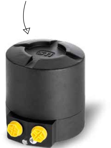
Position transmitter with limit switches (aluminium)