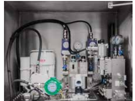
General view inside HPU